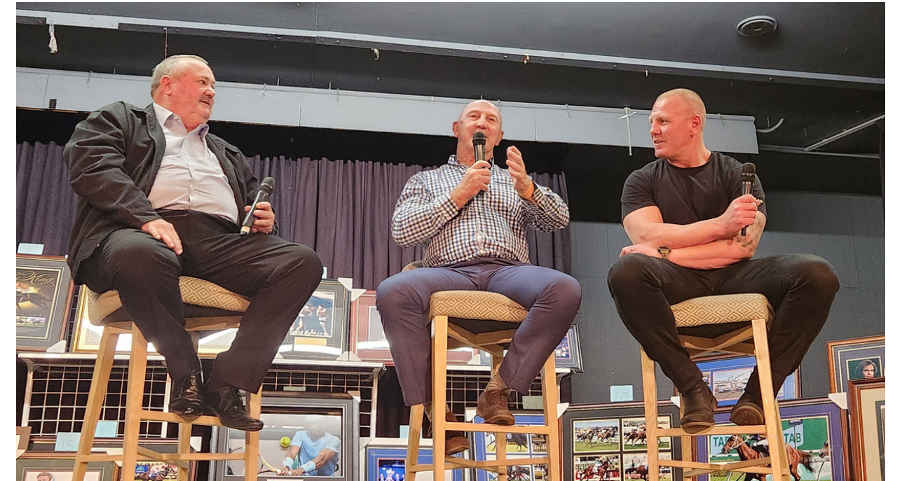
Annual Sports Luncheon