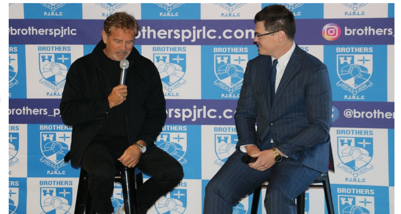
Business Networking Events