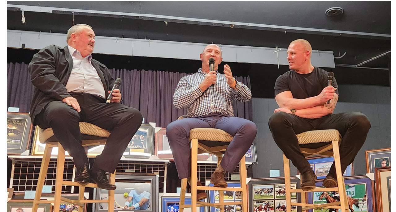
Annual Sports Luncheon