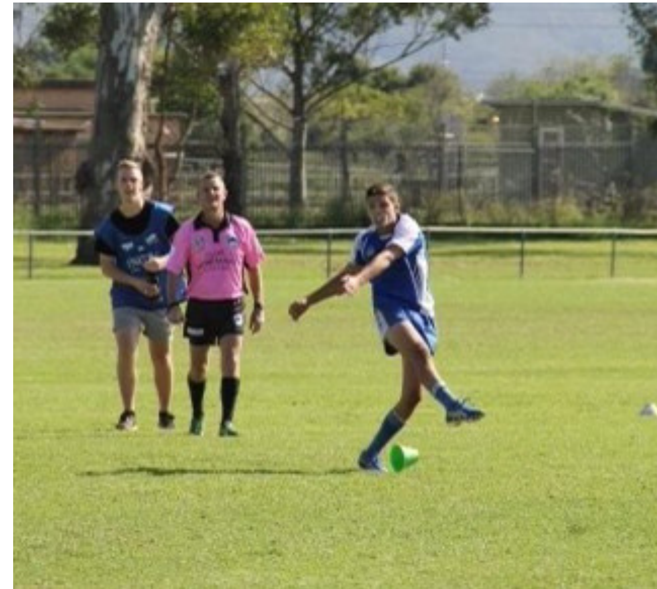
Australian Kangaroos, NSW Blues & premiership winning halfback, Nathan Cleary

In more recent times, Brothers have become a powerhouse within the Penrith district becoming the second largest club in participants & the biggest in the suburb of Penrith in itself. As of 2022, the club have relocated to Parker Street Reserve Ovals in Penrith where new facilities are being built comprising of 4 International Fields. All fields will benefit from the building of a new State of the Art Amenities Building meeting current guideline for Community Sport and NSWRL Major Competitions expected to be ready late 2022/early 2023. Additionally, the Brothers flagship team playing in the NSWRL Sydney Shield competition qualified for their first ever Grand Final.