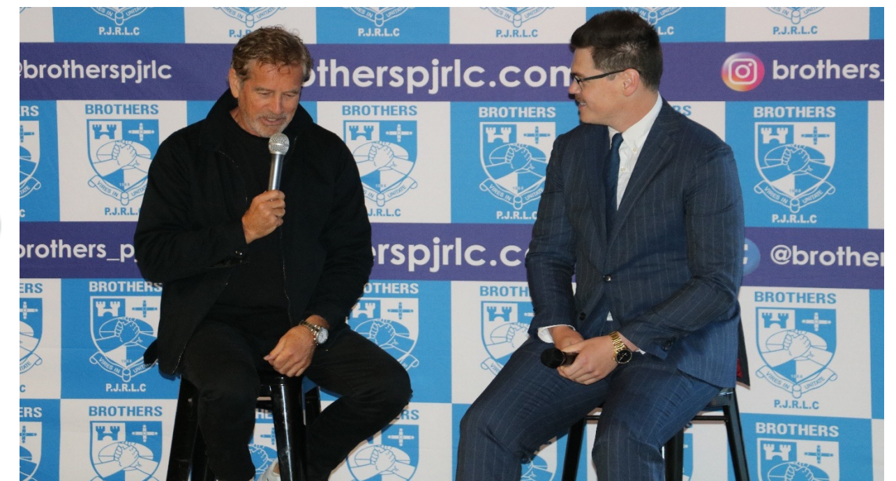
Business Networking Events